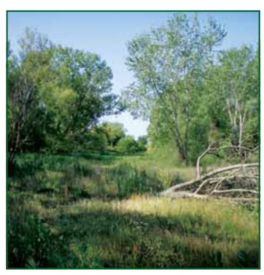
Riparian corridor at Elkhorn Basin Ranch

Our saving grace throughout this ordeal is that Yolo Land Trust holds multiple types