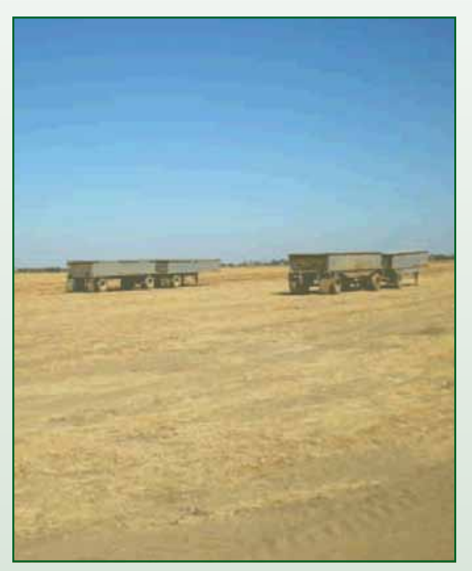
Harvest at Staib Farm

"The Staib easement is yet another great result of the continuing partnership with landowners to implement