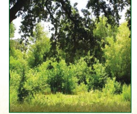
Riparian Habitat at Elkhorn Basin Ranch

The acquisition of the Elkhorn Basin Ranch permanently preserves land in the Elkhorn Basin for agricultural, wildlife habitat and open space use. The project boosts local farmland preservation - as the ranch will remain in productive agriculture